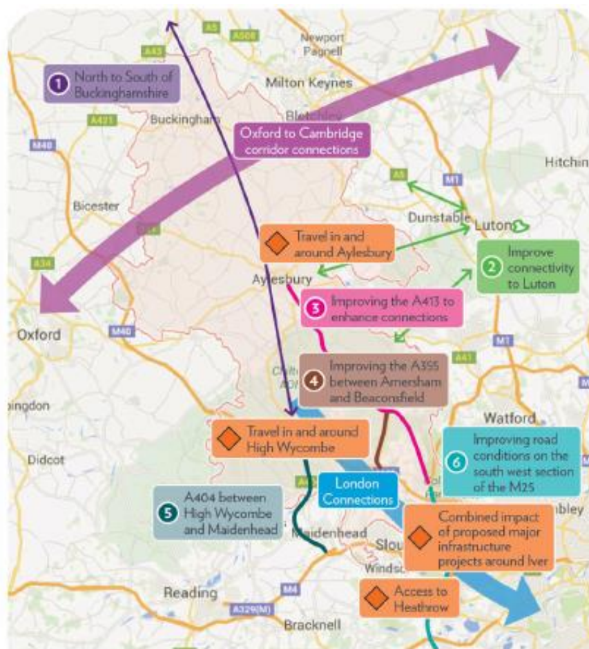
* These issues / solutions are all connected. They are divided up here simply to make the map easier to use

8.18 Investment in this region can have benefits significantly beyond the immediate growth area. Radial connectivity in particular will reduce the existing over-reliance on the London Hubs for cross-regional